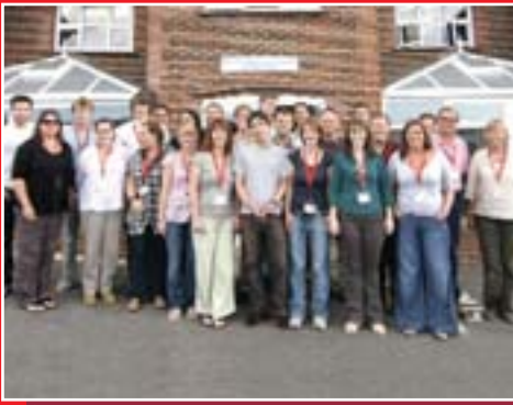
Our English staff