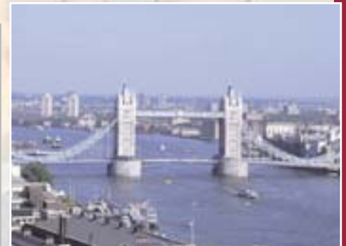
Tower Bridge, London