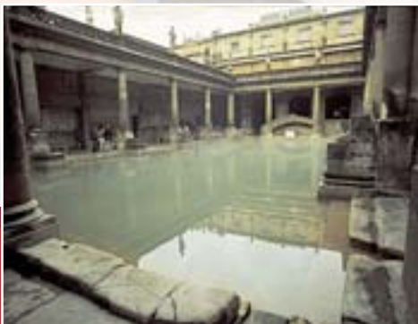
Roman Baths, Bath