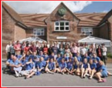
All our Teaching staff