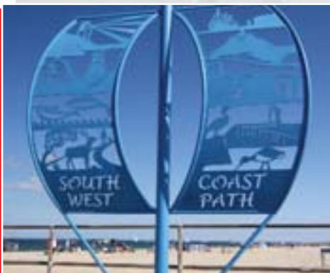
Jurassic Coast Path

This programme is for an accompanying partner who wishes to take part in the leisure and activities programme without the English language lessons