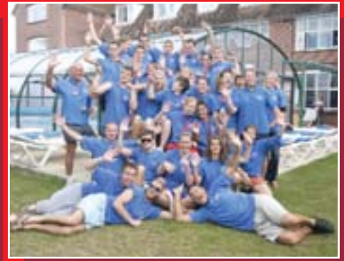
Our Sports staff