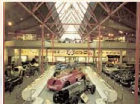
Beaulieu Motor Museum