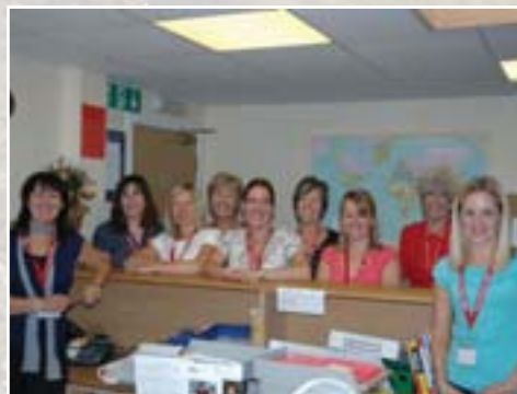
Our Administration staff

Students who wish to enrol on a Cambridge Examination Course are